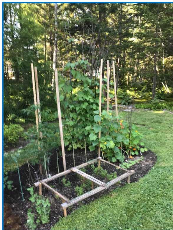
Summer's bounty, 2022